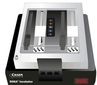
For Batch Processing

Incubate multiple strips simultaneously, then read results in the Charm EZ-M system.