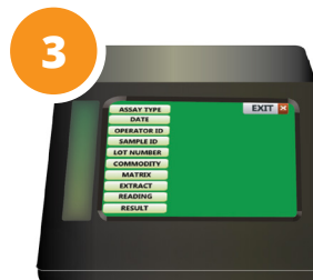
Read Results in Less Than 5 Seconds