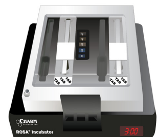
For Batch Processing

Incubate multiple strips simultaneously, then read results in the Charm EZ system.