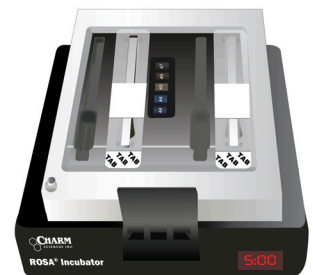
For Batch Processing

Incubate multiple strips simultaneously, then read results in the Charm EZ-M system.